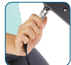
Figure 8 Labeled ② Set Angle right on the equipment!