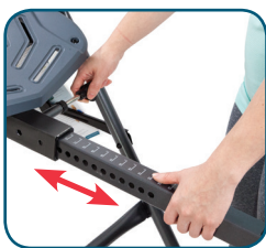
Figure 7 Labeled ① Set Height right on the equipment!