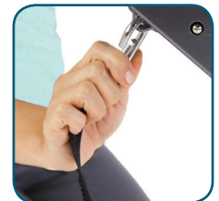
Figure 8 Labeled ② Set Angle right on the equipment!