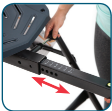
Figure 7 Labeled ① Set Height right on the equipment!