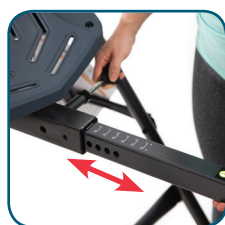
Figure 7 Labeled ① Set Height right on the equipment!