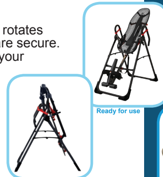
Bed rotated for adjusting the Roller Hinge Setting

BEFORE YOU INVERT make sure that the inversion table rotates smoothly to the fully inverted position and back, and that all fasteners are secure. Make sure the user settings described below are properly adjusted for your unique needs and body type. Take your time finding your proper settings and remember them. Check these settings every time prior to using the equipment.