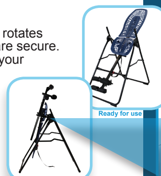
Bed rotated for adjusting the Roller Hinge Setting