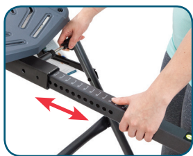
Figure 7 Labeled ① Set Height right on the equipment!