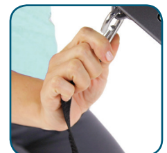
Figure 8 Labeled ② Set Angle right on the equipment!