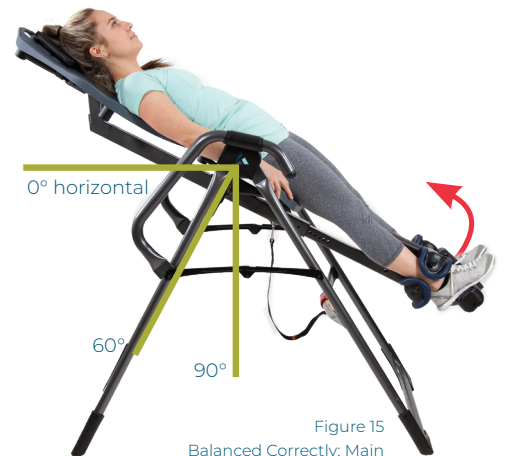
Figure 15 Balanced Correctly: Main Shaft lifts slightly off Crossbar

Your Main Shaft setting should remain the same as long as you continue to use the same Roller Hinge setting and your weight does not fluctuate substantially. If you change your Roller Hinge setting, you should test your balance and control again.